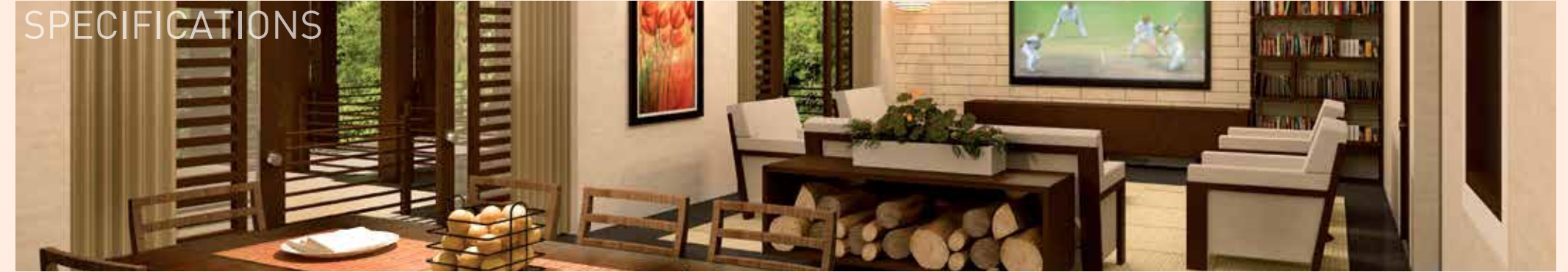
Internal view of villa